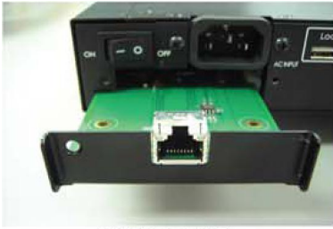
CAT 5 Console Port