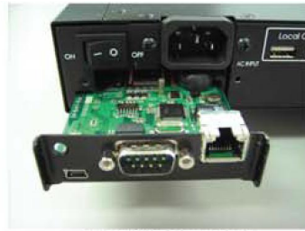
Over IP Console Port