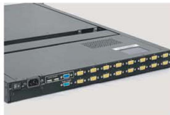
D-Sub 15 pin 16 ports with console