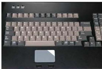
105-Key keyboard with 2-button touchpad