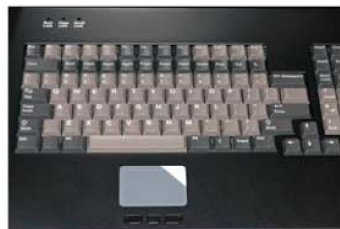
117-Key SUN keyboard with 3-button touchpad