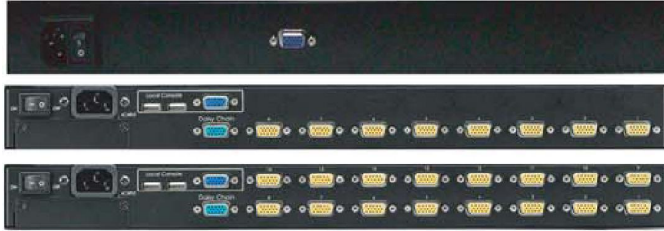
Rear View of 1 / 8 / 16 KVM Ports